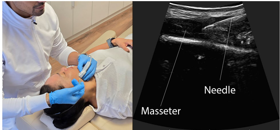
Fig. 2 Ultrasound-guided botulinum toxin injection into the masseter muscle using the SIBUS system